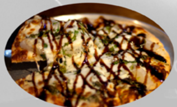
Pear & Gorgonzola pizza