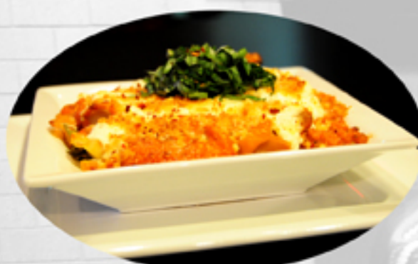
Farfalle A La Vodka

An 18% gratuity may be added to parties of 8 or more guests. Please allow additional time for deep dish pizzas to bake.