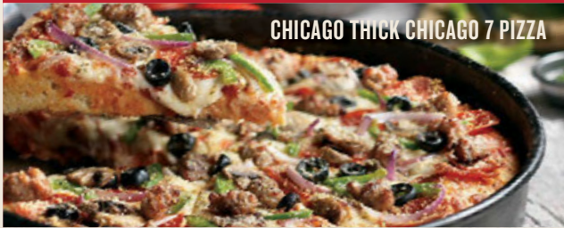
CHICAGO THICK CHICAGO 7 PIZZA

Our crisp on the bottom, soft in the middle cornmeal crust, baked thick and buttery. Chicago Thick crust pizzas are topped with our signature pizza sauce, mozzarella, Parmesan and Romano cheeses, Italian seasonings and fresh toppings.