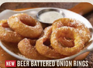
NEW BEER BATTERED ONION RINGS

Fresh-baked Ciabatta garlic bread with roasted garlic butter, topped with mozzarella and provolone cheeses and drizzled with basil oil. Served with pizza sauce for dipping. 3.29