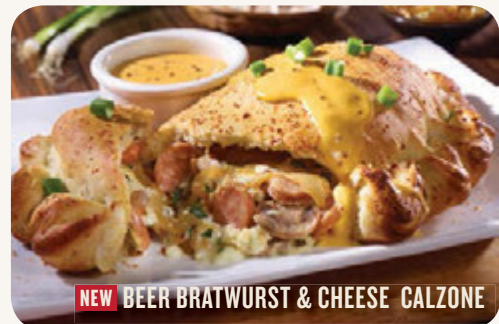
NEW BEER BRATWURST & CHEESE CALZONE

Bratwurst, lager-braised caramelized onions and mushrooms topped with our blend of mozzarella, ricotta and Asiago cheeses, then baked inside our signature braided crust. Topped with mustard cheese sauce made with Guinness and fresh green onions. 9.99