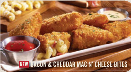
NEW BACON & CHEDDAR MAC N' CHEESE BITES

Mac n' cheese wedges made with cheddar cheese and crispy bacon pieces. Fried golden brown and served with beer cheese dipping sauce and spicy sriracha ketchup. 7.99