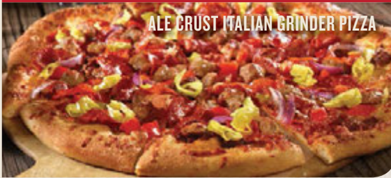
ALE CRUST ITALIAN GRINDER PIZZA

A hand tossed crust crafted with brown ale. Topped with our signature pizza sauce, mozzarella, Parmesan and Romano cheeses, Italian seasonings and fresh toppings.