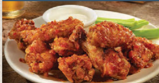
CLASSIC SWEET & SMOKY BACON WINGS

Traditional bone-in, twice cooked chicken wings hand tossed in one of our signature sauces or dry rubs.