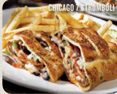
CHICAGO 7 STROMBOLI