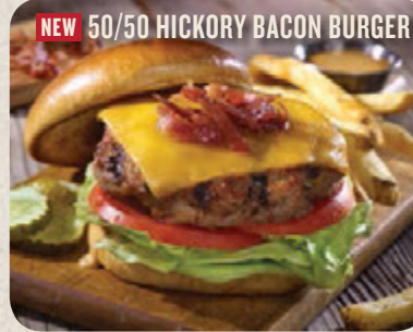
NEW 50/50 HICKORY BACON BURGER