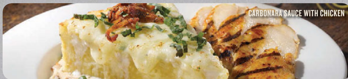
CARBONARA SAUCE WITH CHICKEN

* Our hearty beef burgers are cooked to order. Consuming raw or undercooked meats, poultry, seafood, shellfish, or eggs may increase your risk of foodborne illness, especially if you have certain medical conditions. Hamburgers that are served rare or medium-rare may be undercooked and will only be served upon the consumer's request.