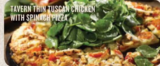
TAVERN THIN TUSCAN CHICKEN WITH SPINACH PIZZA