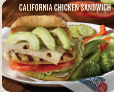
CALIFORNIA CHICKEN SANDWICH