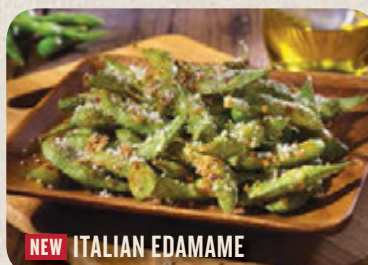
NEW ITALIAN EDAMAME