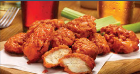
BONELESS ORIGINAL BUFFALO WINGS

Breaded all-white meat boneless chicken wings hand tossed in one of our signature sauces or dry rubs.