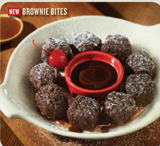
NEW BROWNIE BITES

A deep-dish pizza pan loaded with chocolate chip cookie dough, oven-baked and cut in slices. 6" Serves 1: 2.49 | 9" Serves 2-3: 4.99 | Add vanilla ice cream .99