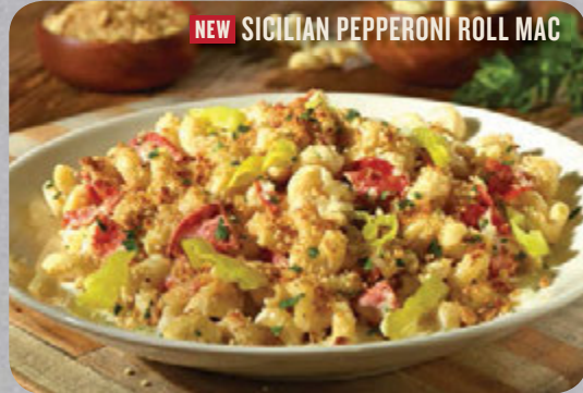
NEW SICILIAN PEPPERONI ROLL MAC

CAPRESE TOPPING: Thick cut fresh mozzarella slices, sliced tomatoes and basil leaves.