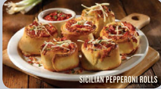
SICILIAN PEPPERONI ROLLS

Signature dough with pepperoni, green onions and cheese. Baked and served with pizza sauce. 8.29