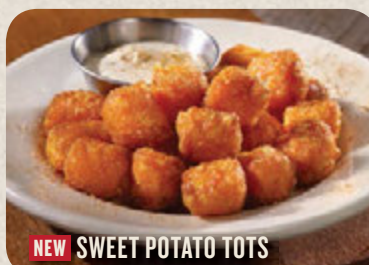
NEW SWEET POTATO TOTS