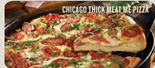
CHICAGO THICK MEAT ME PIZZA