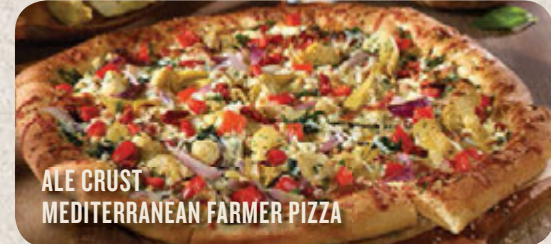
ALE CRUST MEDITERRANEAN FARMER PIZZA